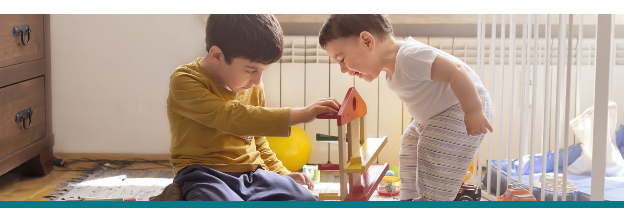
Home > Quality assurance > Product inspections (2 of 2)

Production Monitoring places an inspector on-site at the factory to monitor the manufacturing process and helps ensure materials, quality, and production schedules are met.