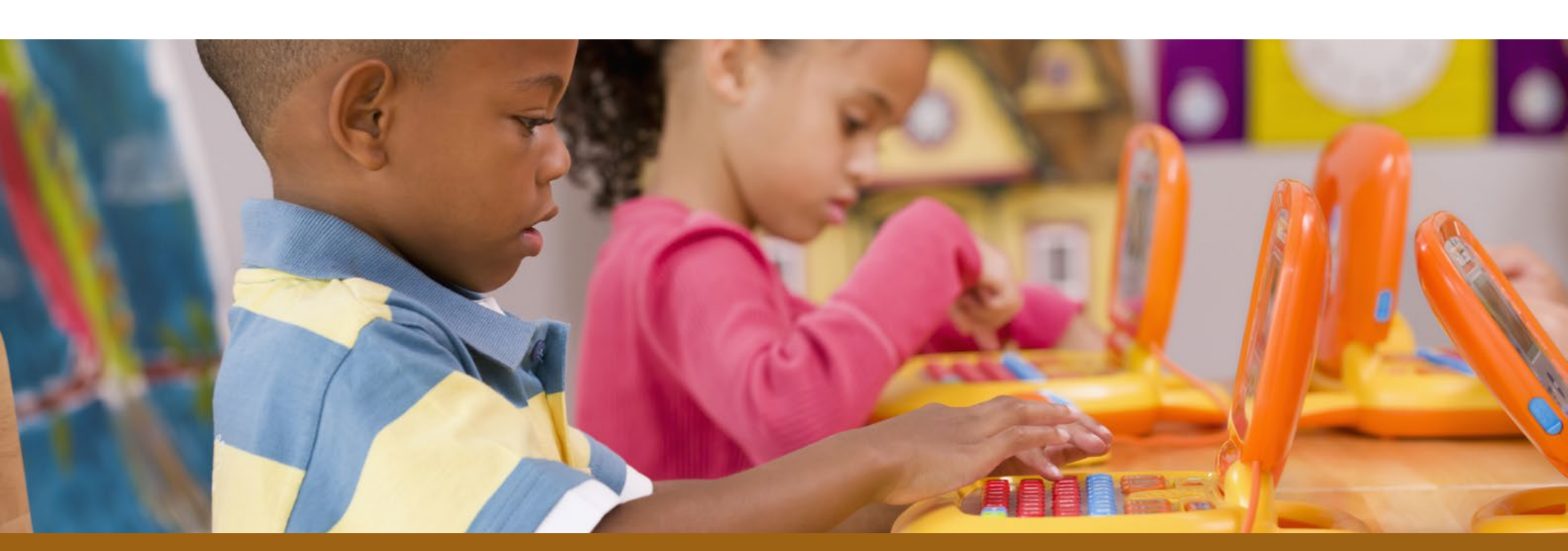
Home > Data management > Tools & resources (2 of 2)

Corrective Action and Lifecycle Management provides transactional solutions, offering the flexibility for clients to collaborate with their supply chain to rectify non-conformities or failures. This application helps to achieve a robust supply chain program using tools like workflows, tasks, and status updates with your testing, inspection and audit programs.